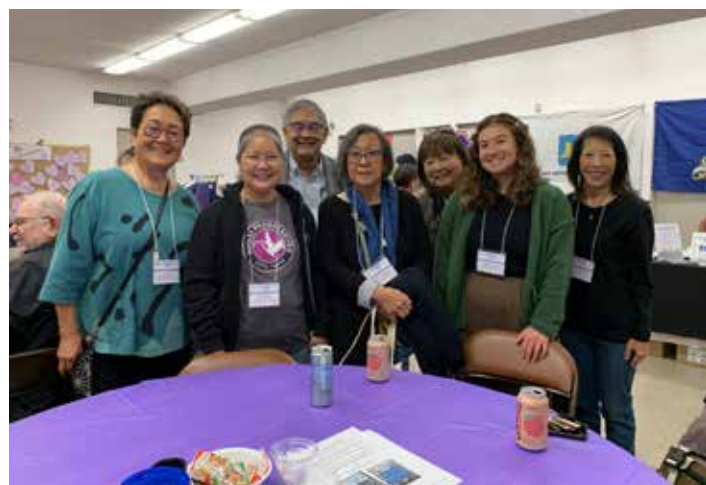
Nikkei Progressive presenters of "Reparations-Then and Now".

I volunteer in memory of my parents who were Go For Broke volunteers and attended the FFNV reunions every year. I have enjoyed getting to know the other volunteers and learning about the veterans in their families. We all work towards the common goal of putting on a successful reunion to honor the legacy of the Nisei veterans.