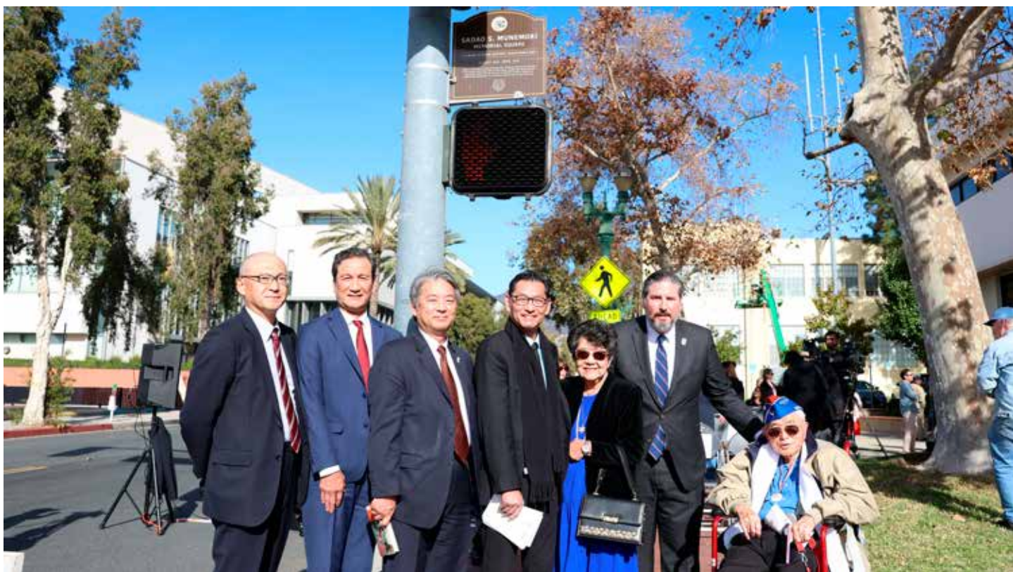
Sadao S. Munemori Memorial Square in Glendale, Calif.