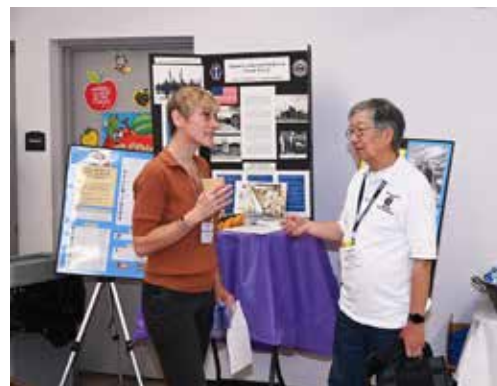
Milo Yoshino exhibit.