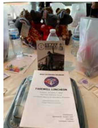
Farewell banquet table setting

I volunteer in memory of my parents who were Go For Broke volunteers and attended the FFNV reunions every year. I have enjoyed getting to know the other volunteers and learning about the veterans in their families. We all work towards the common goal of putting on a successful reunion to honor the legacy of the Nisei veterans.